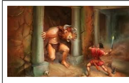
Theseus & the Minotaur