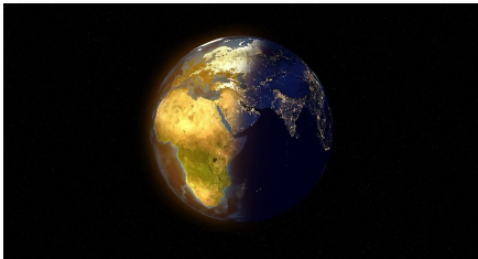
Day and Night

The children will realise that the Earth's rotation explains day and night and the apparent movement of the Sun across the sky.